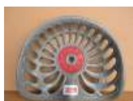
1099 - Jack Maybole £25