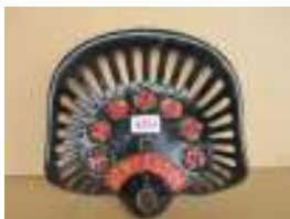
1151 - The Rake, Newcastle £50