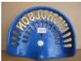
1029 - Nicholson (reverse aspect) £40