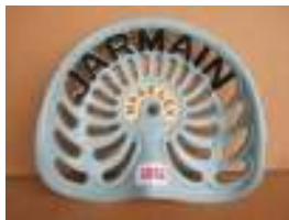
1032 - Jarmain, Haseley £30