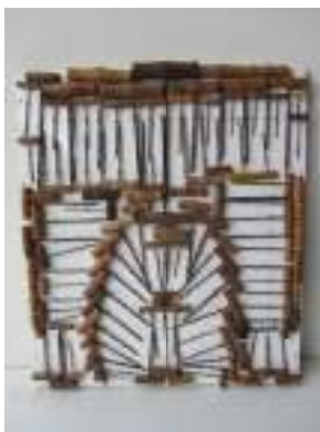
1416 - Collection of augers, gimlets and awls £55