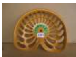
1201 - Hornsby £30