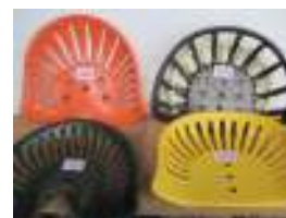
1240, 1241, 1242, 1243 - Four unnamed implement seats £70