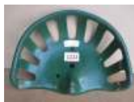
1213 - V.39 £30