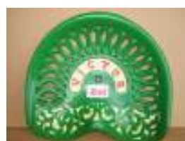
1054 - Victor £35