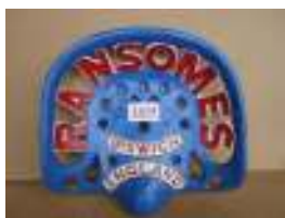
1074 - Ransomes, Ipswich, England £35