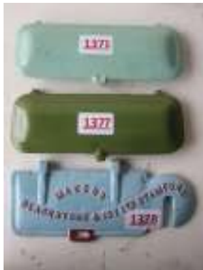
1376 - Toolbox lid £25 1377 - Toolbox lid £20 1378 - Blackstone & Co lid £20