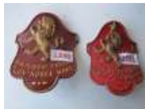
1340 - Bamford Lion Horse Rake