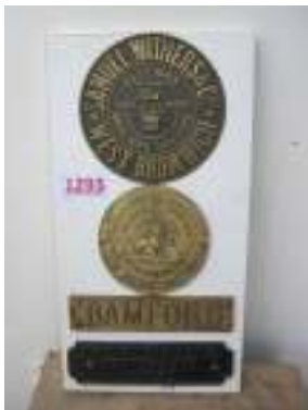
1293 - Collection of name plates £25