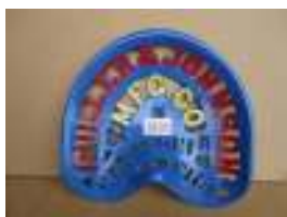
1130 - Fuller & Johnson MFG Co Madison WIS £70