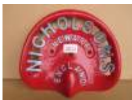
1011 - Nicholson's, Newark, England £30