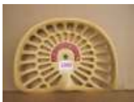
1040 - J B Edlington £130