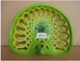
1076 - W Doyle £100