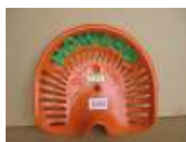
1156 - Howard GP2 £30