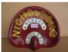
1010 - Nicholson's, Newark, England £30