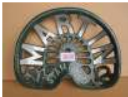
1035 - Martin, Stamford £30