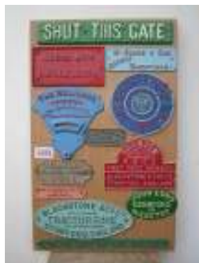
1291 - Collection of name plates £120