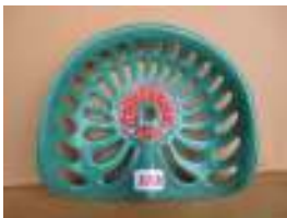
1016 - Hirondelle 24 £30