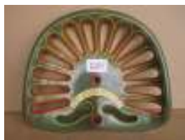
1187 - McCormick £130