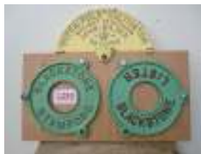
1294 - Collection of name plates £20