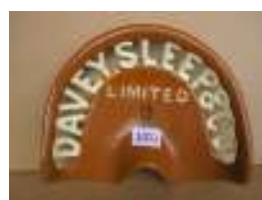
1051 - Davey Sleep & Co Limited £30