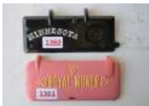
1360 - Minnesota lid £5 1361 - Royal Mower lid £70