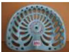
1043 - W Brenton, St Germans £260