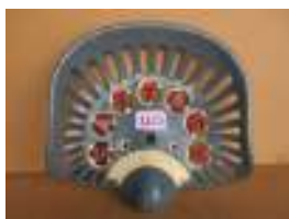
1175 - Sattley £30