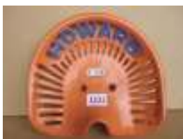
1131 - Howard K24 £30