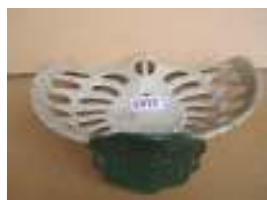
1103 - Bamford (front) B J "Compacta" Bamfords Extending Rake £60