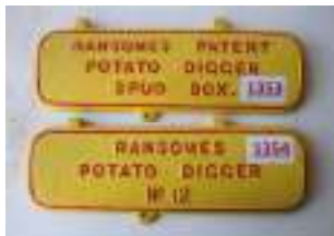
1353 - Ransomes patent Potato Digger spud box £190 1354 - Ransomes potato digger no 12 £40