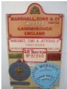
1274 - Collection of name plates £110