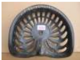
1152 - J F Seiberling & Co, Akron, Ohio £32