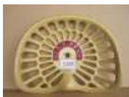
1108 - Deering £65