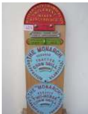
1271 - Collection of name plates £50