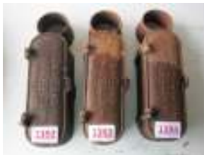
1392 - Bamfords toolbox £22 1393 - Bamfords toolbox £22 1394 - Bamfords toolbox £22