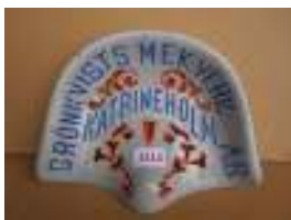
1113 - Grönkvists Mek:Verk: AB Katrineholm £50