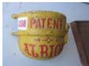
1338 - Patent Albion end cover