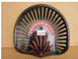
1134 - Frost & Wood £30