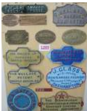
1269 - Collection of name plates £160