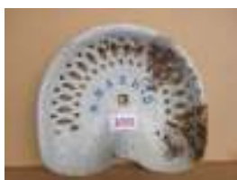
1098 - R Harris £50