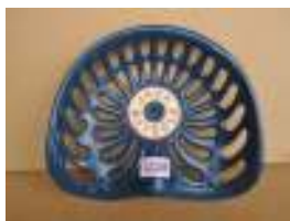
1158 - Jack, Maybole £45