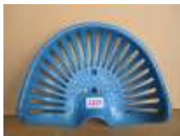
1197 - Howard Bedford RR27 £320