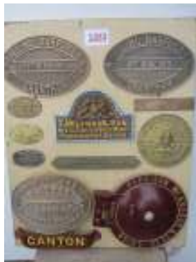
1283 - Collection of name plates £115