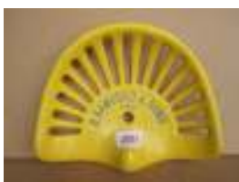
1097 - H Bamford & Sons 1024 £35