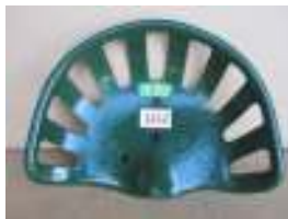
1212 - V.39 £30