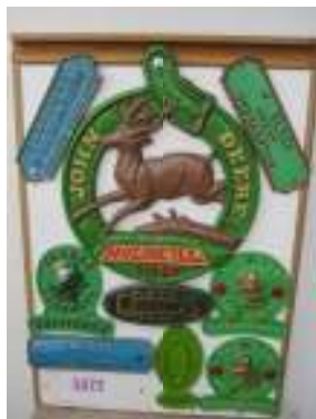
1277 - Collection of name plates £105