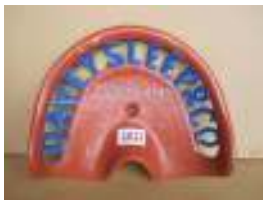
1017 - Davey Sleep & Co Limited £30