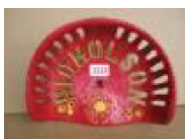
1114 - Nicholson Registered Trademark £40