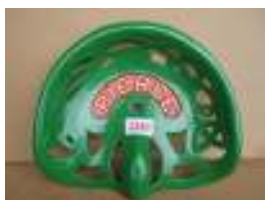
1163 - Pierce £35