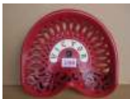
1068 - Victor £30