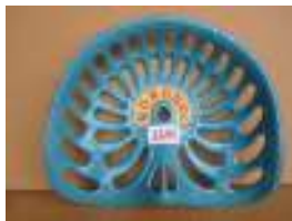
1140 - Noxon Co £45