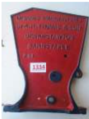
1334 - A H Thomas & Son end plate Sold With 1335 for £10