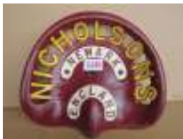
1136 - Nicholson Newark, England £40