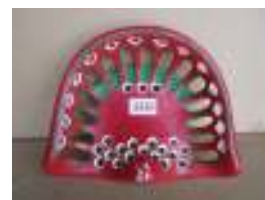
1210 - LA51 £50