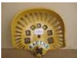
1058 - Racine, WIS £60