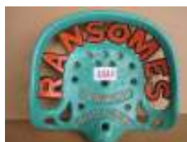
1033 - Ransomes, Ipswich, England £20