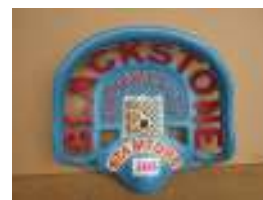
1165 - Blackstone & Compy Ltd, Stamford £40