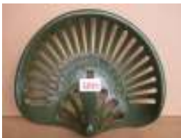
1046 - Walter A Wood, Hoosick Falls NY, USA £15