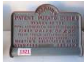
1321 - Martins Patent Potato Digger plate £20