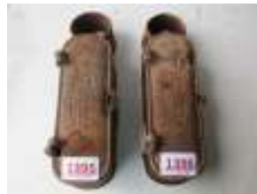
1395 - Bamfords toolbox £18 1396 - Bamfords toolbox £22