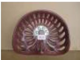
1025 - W.E. Co Ltd £20