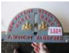
1324 - J Wright Sandford Horse Rake plate £80