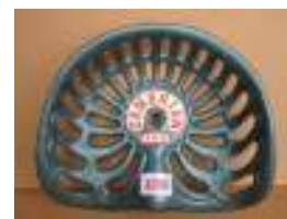
1060 - Cambrian 148 £20