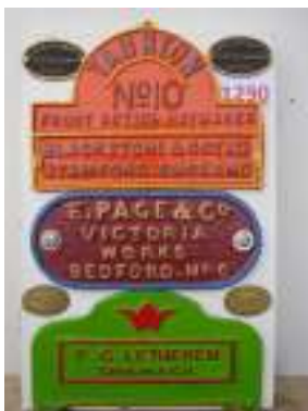
1290 - Collection of name plates £90