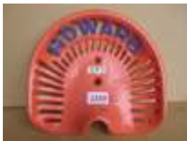
1169 - Howard GP2 £25