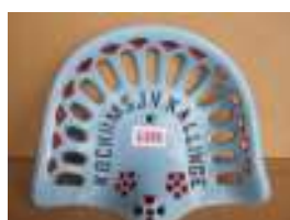
1186 - Kockillms.v. Kallinge £40