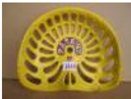
1110 - Patent B & S £20