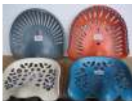
1236, 1237, 1238, 1239 - Four unnamed implement seats £130