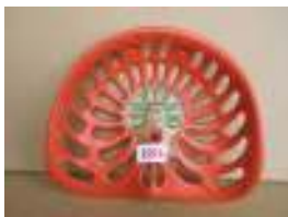
1026 - Bamford £20