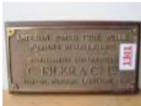
1301 - Artesian Bored Tube Wells brass office plate £10