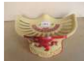
1087 - H Bamford & Sons 1025 £45