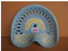
1001 - J Ellacott & Sons £250