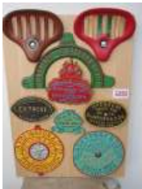
1292 - Collection of name plates £105