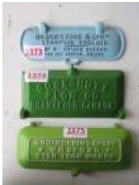
1373 - Blackstone lid £600 1374 - Cockshutt lid £12 1375 - Engineering Co £20