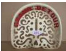
1071 - Grand Detour £90