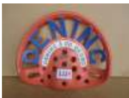
1124 - Dening & Co, Chard HR19 £55