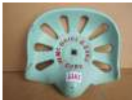
1167 - W McBride & Sons, Cork £42