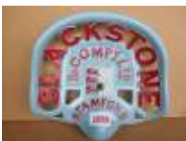
1088 - Blackstone & Compy Ltd, Stamford £35