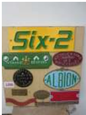
1286 - Collection of name plates £60