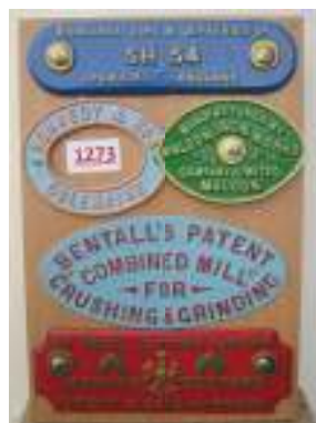
1273 - Collection of name plates £60