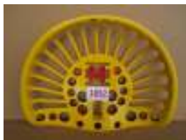
1092 - M £25