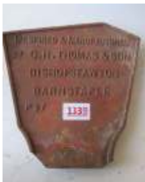
1339 - G H Thomas & Son, Bishopstawton end plate