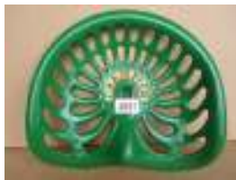
1047 - Champion £40