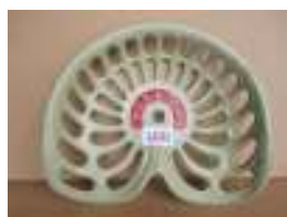
1141 - Hornsby £40