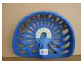
1039 - Jarmain, Haseley £20