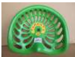
1191 - Toronto 34 £35