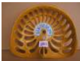
1065 - Bamfords Ltd £50