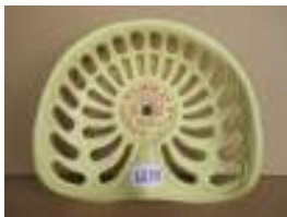
1139 - H V McKay Pty Ltd Sunshine Buy Australian Goods £45