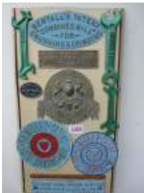
1284 - Collection of name plates £80