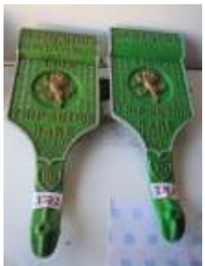
1322 & 1323 - Bamfords, Uttoxeter Trip Action Rake Plates £10