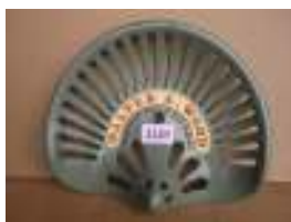
1164 - Walter A Wood, Hoosick Falls, NY, USA £25