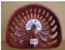
1166 - Dickie £60