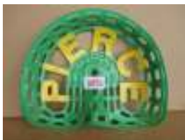
1091 - Pierce £25