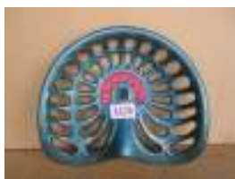
1176 - Whitely £35