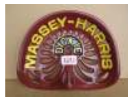
1147 - Massey-Harris, Dickie £70