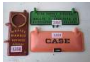
1357 - Wallis & Steevens lid £15 1358 - Massey Harris, Toronto, Canada plate 1359 - Case tool box lid £10 (both)