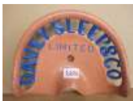
1104 - Davey Sleep & Co Limited £35