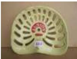
1019 - Albion 5329 £25