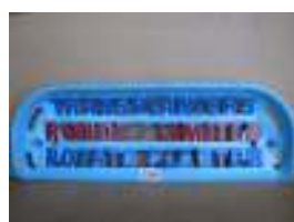
1204 - Transplanters Robet Limited Potato Planter £210