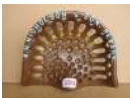
1101 - W N Nicholson & Son, Newark, England £40