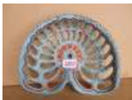
1203 - Hornsby £30