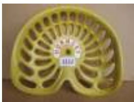
1112 - Hornsby £25