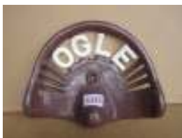
1125 - OGLE £70