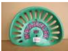
1118 - Kearsley 28 £300