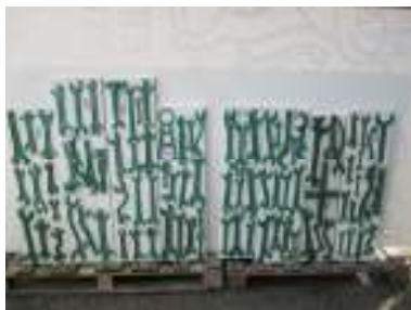
1252 to 1259 - 8 displays of Implement Spanners £110