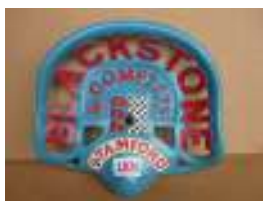
1070 - Blackstone & Compy Ltd, Stamford £35