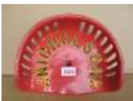
1055 - Nicholson £35