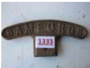
1333 - Bamfords plate £5