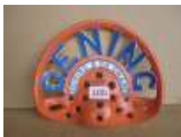
1185 - Dening, Dening & Co Chard HR19 £45