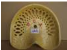
1121 - W C A £440