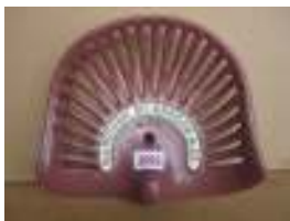
1061 - Harrison McGregor & Co 456 £100