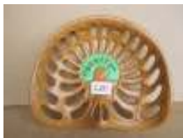
1182 - "Verite" £35