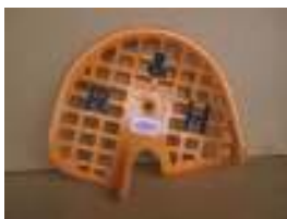
1067 - R & H £650