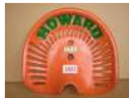
1027 - Howard GP2 £40