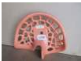
1206 - A5RP £90