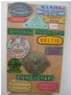
1275 - Collection of name plates £250