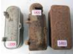
1399 - Bamfords toolbox £28 1400 - Blackstone toolbox £75 1401 - Toolbox £20