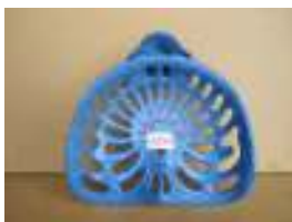
1154 - Bamford (front) Bamfords "Lion" Horse Rake (reserve) £40