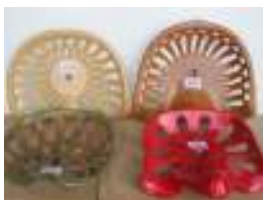
1220, 1221, 1222, 1223 - Four unnamed implement seats £65