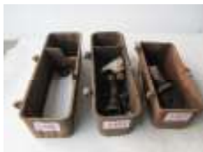
1405 - Toolbox sold with 1361 1406 - Toolbox sold with 1369 1407 - Toolbox sold with 1372