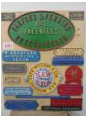
1281 - Collection of name plates £300