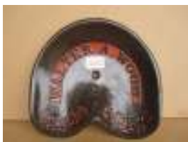
1127 - Walter A Wood £50