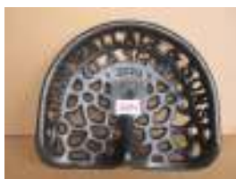
1194 - John Wallace & Sons, Glasgow, 18C £45