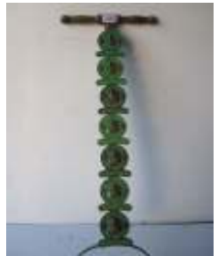
1347 - Set of Ransomes mower plates 9" to 15" £70