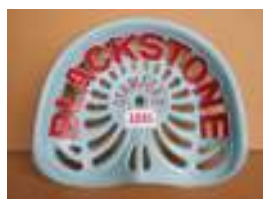
1036 - Blackstone, Stamford £25