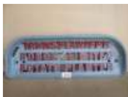
1205 - Transplanters Robet Limited Potato Planter £220