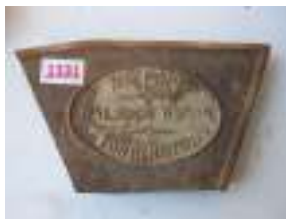
1331 - W M Pope Malsdon Works end plate £20