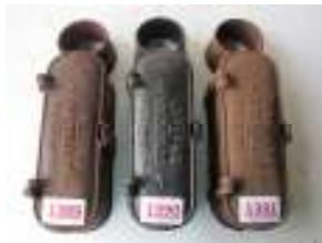
1389 - Bamfords toolbox £17 1390 - Bamfords toolbox £17 1391 - Bamfords toolbox £20