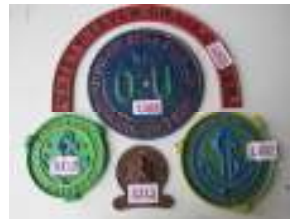
1307 to 1311 - Collection of 5 name plates £30