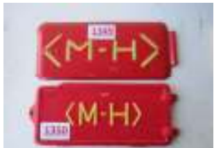
1349 - M.H plate 1350 - M.H plate £20 (both)