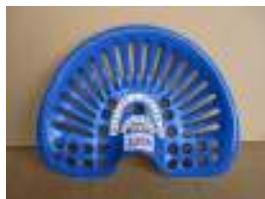
1196 - Western L Roller Co, Hastings NEB £55