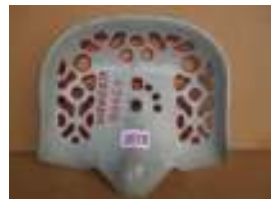
1078 - Bowden, Bovey £1,000