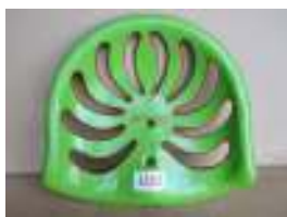
1209 - MO10 £45