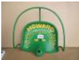
1020 - Howard SR12 £280