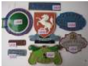
1312 to 1319 - Collection of 8 name plates £100