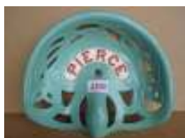
1100 - Pierce £20