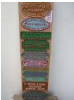
1272 - Collection of name plates £240