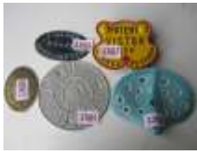
1302 to 1306 - Collection of 5 various plates £20