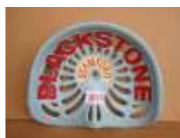
1063 - Blackstone, Stamford £25