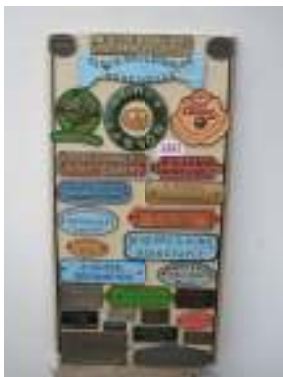
1287 - Collection of name plates £280