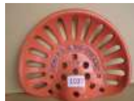
1030 - Dening & Co Chard HR19 £50