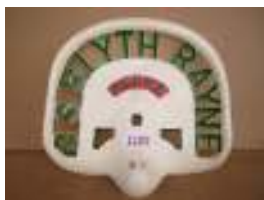
1188 - C S Blyth Rayne, Essex £320