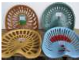
1232, 1233, 1234, 1235 - Four unnamed implement seats £70