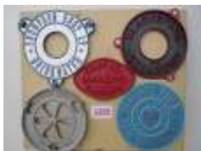
1295 - Collection of name plates £30