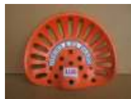
1120 - Dening & Co, Chard £55