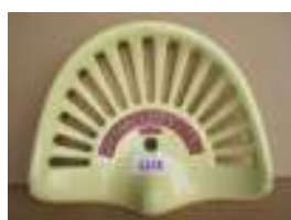
1126 - H Bamford & Sons 1024 £25