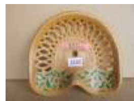
1195 - Bate, Launceston £290