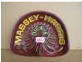
1031 - Massey-Harris, Dickie £80