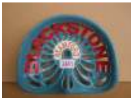
1109 - Blackstone, Stamford £30