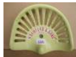
1105 - H Bamford & Sons 1024 £25