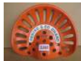
1162 - Deney & Co, Chard HR19 £45