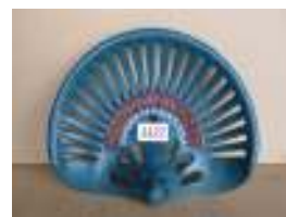
1177 - Walter A Wood, Hoosick Falls, NY USA £28