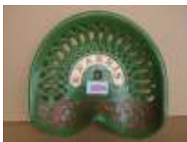
1094 - R Harris £90