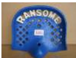
1161 - Ransome £120