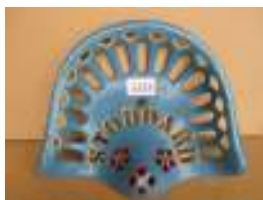
1143 - Stoddard £35