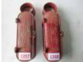
1397 - Bamfords toolbox £22 1398 - Bamfords toolbox £22