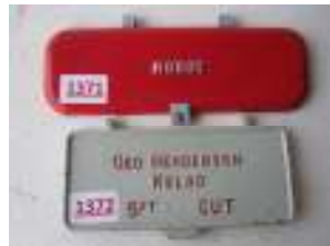
1371 - Robot toolbox lid £50 1372 - Geo Henderson Kelso 5ft cut toolbox lid £100