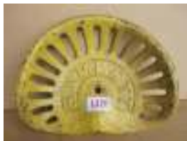
1170 - Bamlett £30