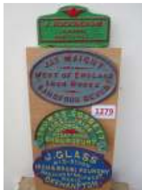
1279 - Collection of name plates £380