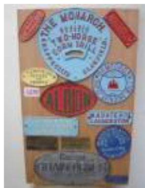
1270 - Collection of name plates £110