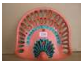
1183 - Adriance Buckeye £40