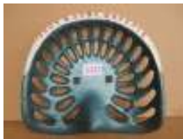
1137 - Jack & Sons, Maybole £40