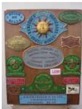
1280 - Collection of name plates £100