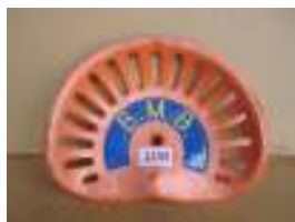
1199 - B M B £170