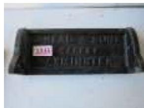
1335 - G Heal & Son, Axminster plate