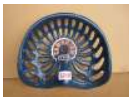
1160 - Cambrian 148 £35