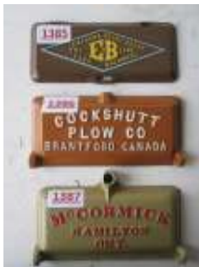
1385 - Emerson Brantingham lid 1386 - Cockshutt Plough Co lid 1387 - McCormick, Hamilton lid £25 (both)