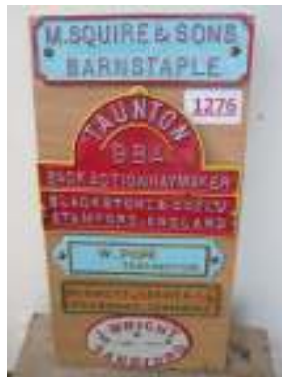
1276 - Collection of name plates £130