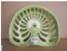
1034 - Denny 4239 £35