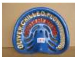
1171 - Oliver Chilled Plow. Works South Bend IND £50