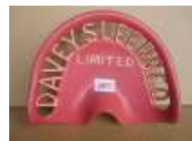
1090 - Davey Sleep & Co Limited £30