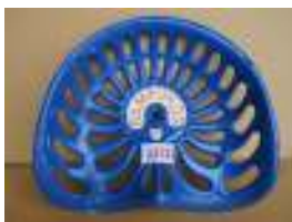
1172 - Bamfords £25