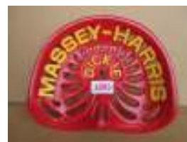
1045 - Massey-Harris, Dickie £90