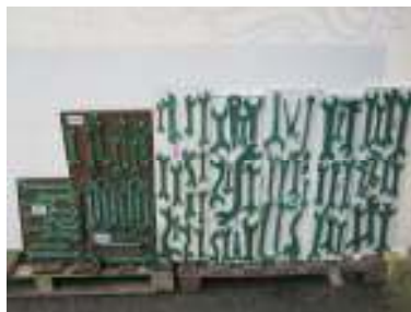
1260 to 1267 - 8 displays of implements spanners inc Fordson £129