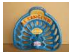
1132 - R Wallut & Co, Le Sanglier Marque Deposee S2 £50