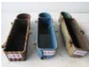
1408 - Toolbox sold with 1375 1409 - Toolbox sold with 1376 1410 - Toolbox sold with 1377