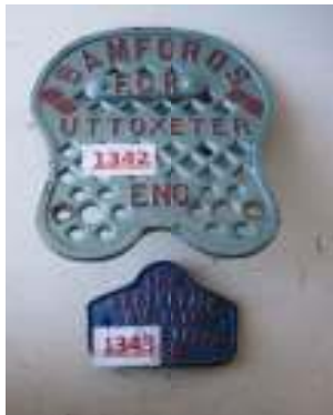
1342 - Bamfords, Uttoxeter Implement seat back 1343 - Lion Perfection Modele Leger £20 (for both)