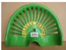
1041 - Pierces, Wexford £25