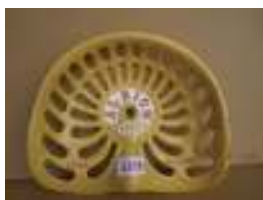
1146 - Albion, 4239, Leigh, England £30