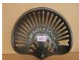
1093 - W M Doyle & Co Ltd £25