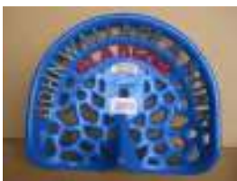
1049 - John Wallace & Sons, Glasgow 18CR £50