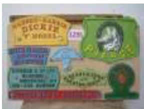
1296 - Collection of name plates £90