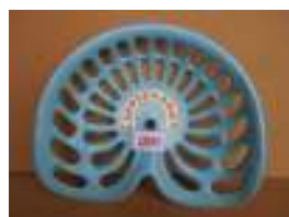
1006 - E Bowden, Bovey £320