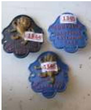
1344 - Bamfords Lion Swath-Turner 1345 - Bamfords "Compacta" extending rake 1346 - Bamfords Lion Horse rake £60 (all 3 lots)