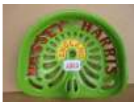
1089 - Massey Harris, England £190