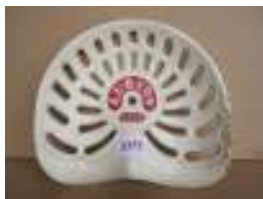
1149 - Albion 5329 £30