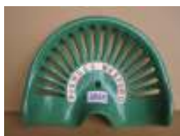
1024 - Pierces, Wexford £30