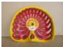
1184 - Percival £35