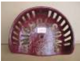
1022 - Nicholson Registered Trade Mark £50