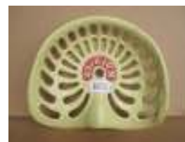
1072 - Albion £25