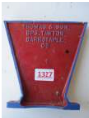
1327 - Thomas & Son, BPS Tawton, Barnstaple end plate