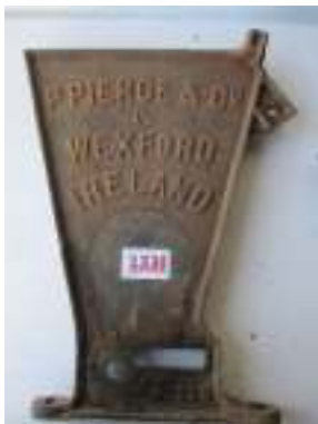
1330 - Pierce & Co Ltd, Wexford, Ireland plate £10