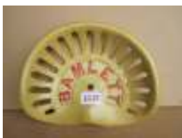
1119 - Bamlett £35