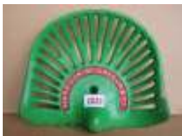
1028 - Harrison McGregor & Co £45