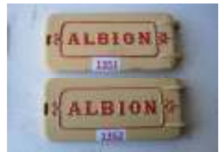
1351 - Albion plate 1352 - Albion plate £17 (both)