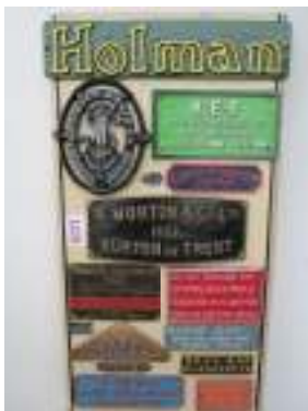
1278 - Collection of name plates £80