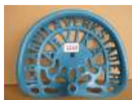
1153 - A B Arvikaverkstader, Arvika £65