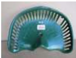
1211 - R55 £40