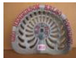
1015 - Geo Henderson Kelso Foundry £100