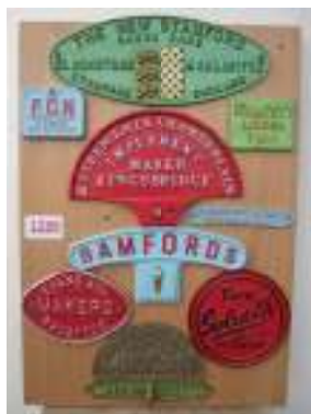
1289 - Collection of name plates £90