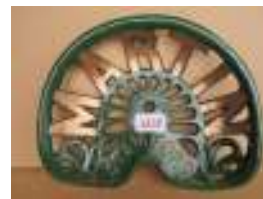
1150 - Martin, Stamford £35