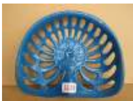
1128 - Albion, Leigh, England 4239 £15