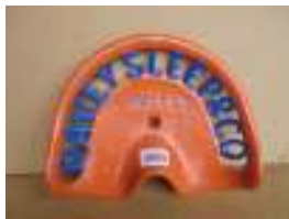
1005 - Davey Sleep & Co Limited £25