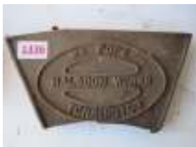
1336 - W M Pope, Malsdon Works plate Sold with 1337 For £55