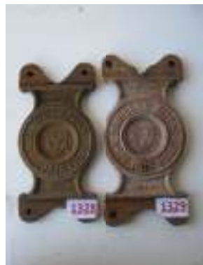
1328 - Bamfords Patent Wrot iron frame plate 1329 - Another as above