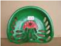
1079 - W H Reed, Lanson £700