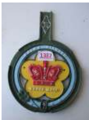
1337 - Crown Diamond W K S & P Trade Mark plate