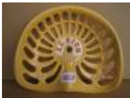
1023 - Albion 5329 Leigh, England £20