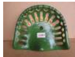
1180 - W M Nicholson & Son, Newark, England £70