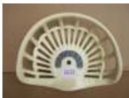
1173 - Bamfords £45