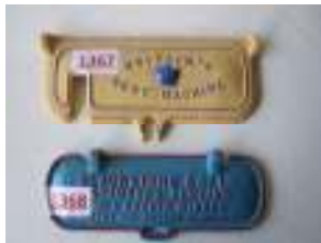
1367 - Britain's Best Machine toolbox lid £12 1368 - Blackstone & Co Ltd toolbox lid £40