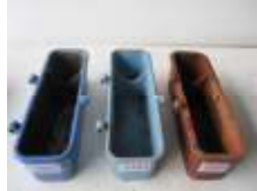
1402 - Toolbox sold with 1353 1403 - Toolbox sold with 1354 1404 - Toolbox sold with 1371