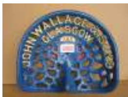
1050 - John Wallace & Sons, Glasgow 18CR £60