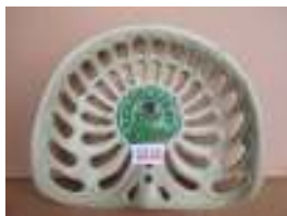
1122 - Kearsley & Co, Ripon Z207 £100