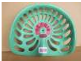
1008 - Dennis 5329 £50