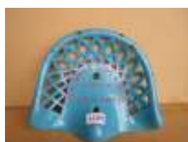
1189 - Ransomes, Sims & Head, Ipswich, England £330