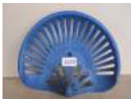
1178 - Walter A Wood, Hoosick Falls NY, USA £28