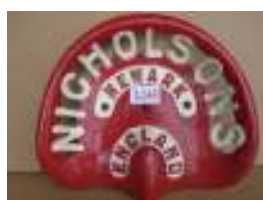
1144 - Nicholson, Newark, England £30