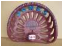
1133 - The Plano Manu- facturing Co, Chicago USA Manual Reaper £70