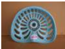
1179 - Melb Gaston Bros Pty Ltd A51 £45