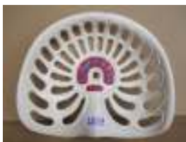
1064 - Cambrian 148 £40