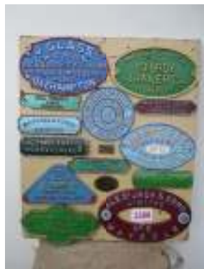
1288 - Collection of name plates £150