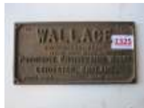
1325 - Wallace plate £16