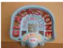
1116 - Blackstone & Comply Ltd, Stamford £85