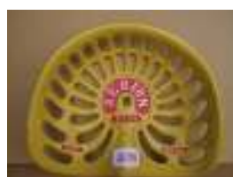
1096 - Albion 5329 Leigh, England £25