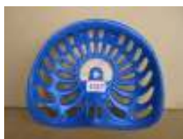
1018 - Bamford £25