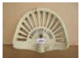
1084 - H Bamford & Sons 1024 £40