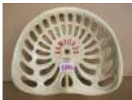
1086 - Bamfords £20