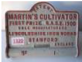
1320 - Martins Cultivator Plate No 1 £30