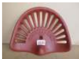
1193 - H Bamford & Sons 1024 £32