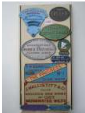
1285 - Collection of name plates £140