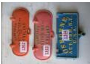
1362 - Bamfords lid £15 1363 - Bamfords toolbox lid 1364 - Osborne, Auburn lid £15 (both)