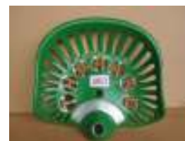
1057 - The Rake £50