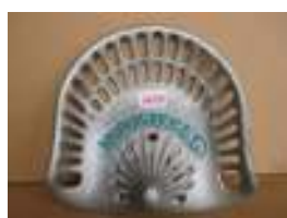
1174 - Maxwell £45