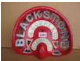
1085 - Blackstone & Compy Ltd, Stamford £35