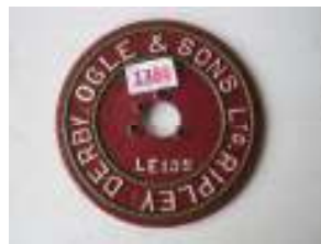
1388 - Ogle & Sons Ltd, Ripley, Derby plate £12