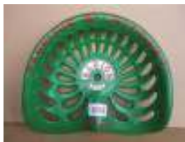
1062 - Harrison McGregor & Co Albion 928 Leigh £40