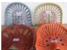
1244, 1245, 1246, 1247 - Four unnamed implement seats £110