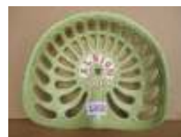
1102 - Albion 4239 £25