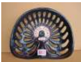
1037 - Cottis, Epping 52 £40