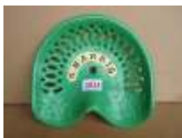
1014 - R Harris £100