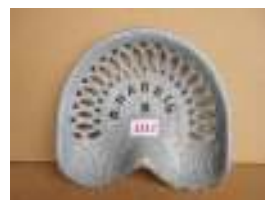
1117 - R Harris £60