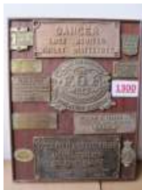
1300 - Collection of name plates £20