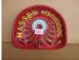
1077 - Massey Harris, England £200