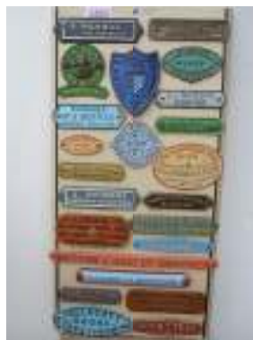
1282 - Collection of name plates £330