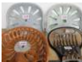
1248, 1249, 1250, 1251 - Four unnamed implement seats £75