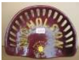
1053 - Nicholson Registered Trademark £40