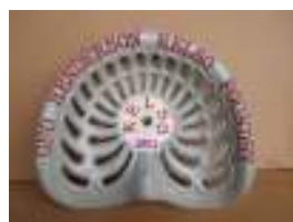
1003 - Geo Henderson Kelso Foundry £100