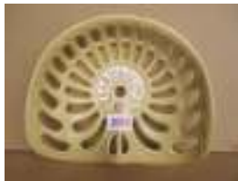
1083 - Bamfords Ltd £25