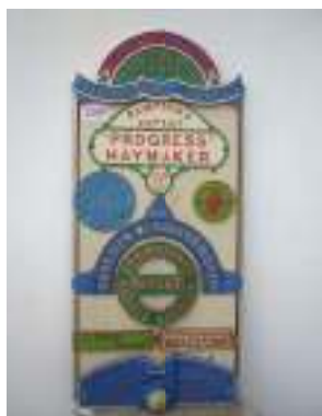
1268 - Collection of name plates £220