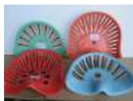
1216, 1217, 1218, 1219 - Four unnamed implement seats £50