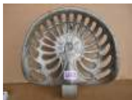
1202 - Albion 4239 on spring £30