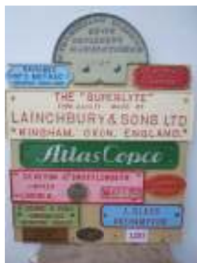
1297 - Collection of name plates £130