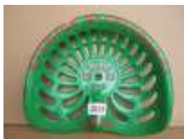
1038 - Harrison McGregor & Co Leigh Albion 928 (small chip) £30