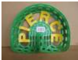
1002 - Pierce £25