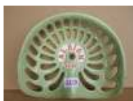
1129 - Albion 4239 £25