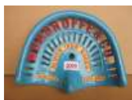
1009 - Woodroffe & Co Albion Iron Works, Rugeley, England £160