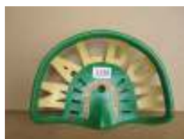
1138 - Maldon, Maldon Iron Works Compy Ltd £260