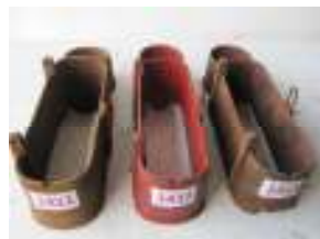
1411 - Toolbox sold with 1362 1412 - Toolbox sold with 1379 1413 - Toolbox without lid £5