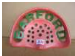
1181 - Barford £390