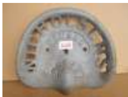
1148 - Nicholson, Newark, England £30