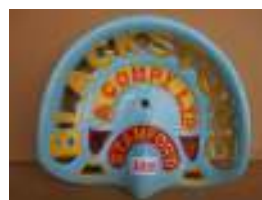
1048 - Blackstone & Compy Ltd, Stamford £30