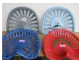
1228, 1229, 1230, 1231 - Four unnamed implement seats £70