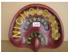
1142 - Nicholson, Newark, England £35