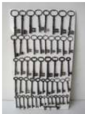
1417 - Collection of keys £40