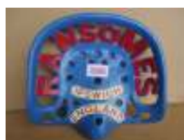
1066 - Ransomes, Ipswich, England £30