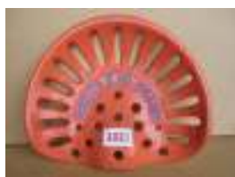
1021 - Dening & Co Chard £40