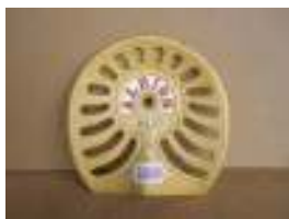
1200 - Albion 8412 £40