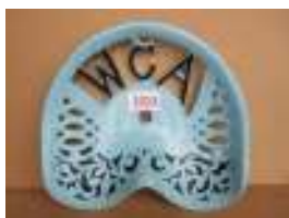
1013 - W.C.A £620