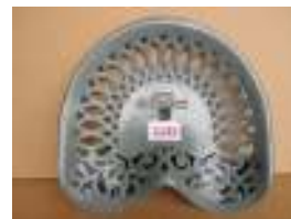
1135 - Bate, Launceston £310