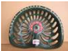
1004 - Powell Brothers & Whittaker, Wrexham 340 £105