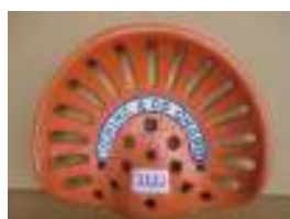
1123 - Dening & Co, Chard £50