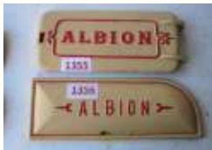
1355 - Albion plate 1356 - Albion plate £40 (both)