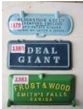
1379 - Blackstone lid £40 1380 - Ideal Giant lid 1381 - Frost & Wood lid £22 (both)