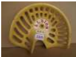
1106 - Albion 8974 £220