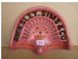
1007 - Pickleys Sims & Co Limited Leigh, Lancashire, England £280