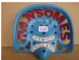
1157 - Ransomes, Ipswich, England £40