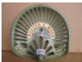
1073 - Walter A Wood, Hoosick Falls, NY USA £65