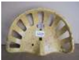
1214 - V.39 £30