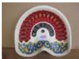
1190 - Orion £200