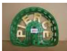
1069 - Pierce £30