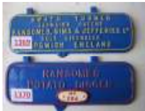
1369 - Swath Turner toolbox lid £35 1370 - Ransomes Potato digger no 28A lid £18