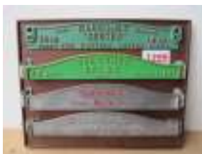
1299 - Collection of name plates £55