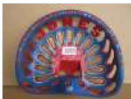
1095 - Jones, The Plano Manufacturing Co, Chicago, USA J127 £35