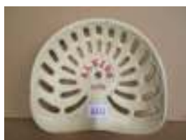
1111 - Albion 5329 £20