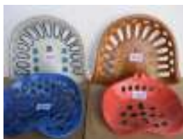
1224, 1225, 1226, 1227 - Four unnamed implement seats £65