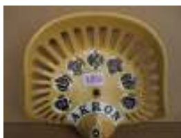
1056 - Buckeye, Akron O (front) Aultman Miller & Co (reverse) £45