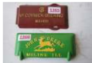
1365 - McCormick Deering toolbox lid 1366 - John Deere lid £20 (both)