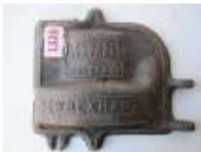
1326 - Powell Brothers cover plate £10