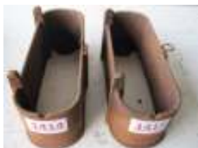
1414 - Toolbox sold with 1373 1415 - Toolbox sold with 1368