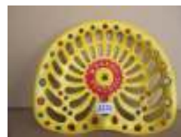
1192 - Massey Toronto £400