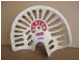
1082 - Albion 8980 £100