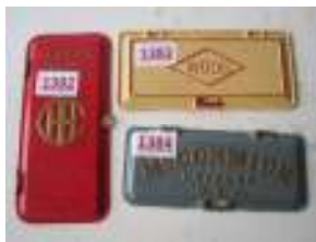
1382 - Regular gear lid 1383 - Wood lid £15 (both) 1384 - McCormick lid sold with 1385 £20 (both)