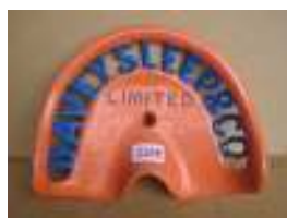
1168 - Davey Sleep & Co Limited £30