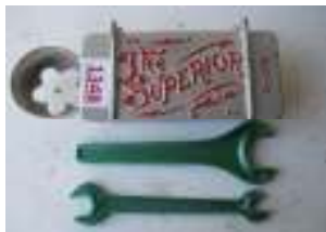
1348 - The Superior Tool box plus 2 spanners £22