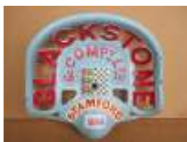
1044 - Blackstone & Compy Ltd, Stamford £40