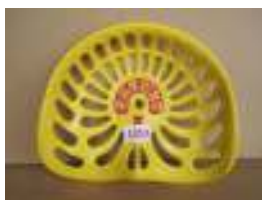
1059 - Patent £20