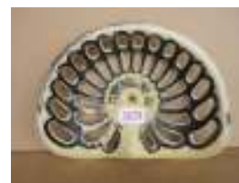
1075 - Malta £20