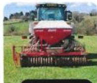
For all herbal lay overseeding