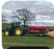
Free Soil Testing Lime & Sand Options