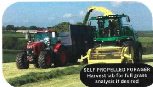
SELF PROPELLED FORAGER Harvest lab for full grass analysis if desired

Triple Mowers Double Mowers Tedding 50ft Rake 30ft Rake 4 Silage Trailers Buckrake Loading Shovel Baling Bale Carting & Stacking