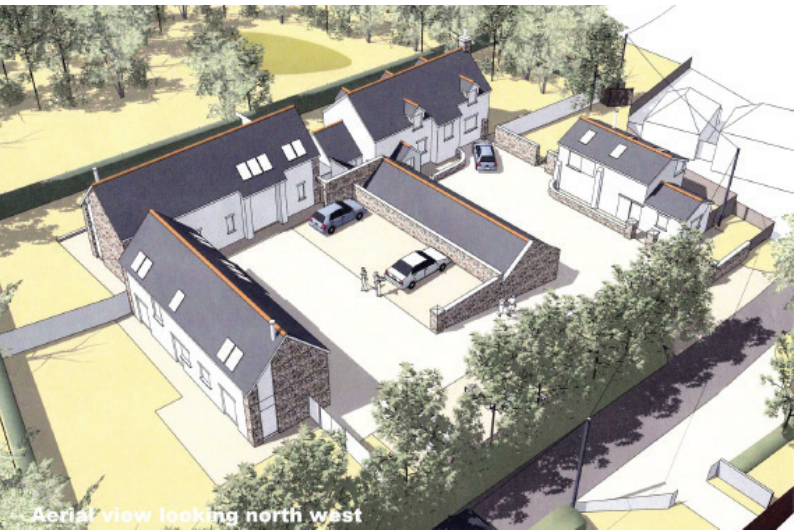
Aerial view looking north west