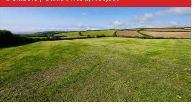
Approx. 88.25 acres comprising a block of level or very gently sloping land currently in arable and temporary pastures, mostly contained in large, easy working, enclosures. Liskeard Farms & Land Department