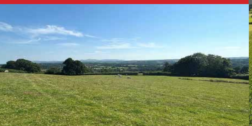
Land at Stoke Canon Exeter, Devon | Offers in Excess of £375,000

Hatherleigh | Guide Price £120,000 - £140,000