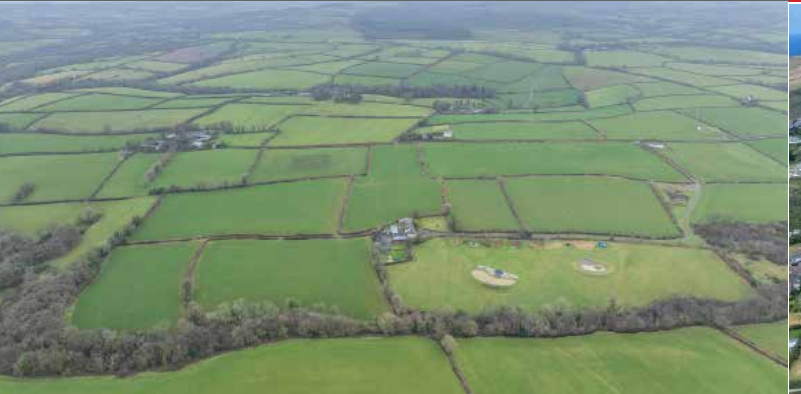
Land at Polzeath

Ashwater, Beaworthy | Guide Price £620,000