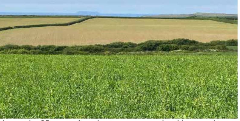
Just under 35 acres of productive pasture and arable ground in a sought after farming area with road frontage and access and far-reaching views as far as Lundy Island.

Holsworthy Farms & Land Agency Farms@kivells.com | 01409 259547