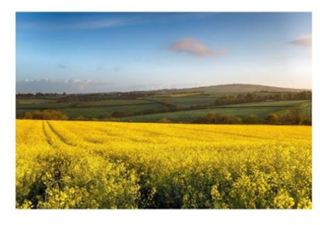
Contact your Rural Professional Team today for expert advice