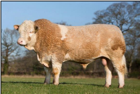
Vale Royal Hamish 16

Marketed by Norbreck genetics as their fastest selling Simmental bull. Limited semen available. Suitable for commercial dairy farmers and pedigree breeders, Vale Royal Hamish stamps light coloured progeny that are born easily and are making significant premiums at auction. Purchased by Strathisla as a stock bull to be used on heifers.