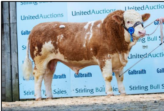
Kinclaven Infusion 17 P

Kinclaven Infusion was purchased at the 2019 Stirling Bull Sales where he was second in his class. Offering new bloodlines to Bosahan his maternal pedigree features the sale topping Omorga Samson (Raceview King) and a Royal Highland Show prize winning dam while his sire bred in Denmark is a trait leader for 200, 400 & 600 day weights.