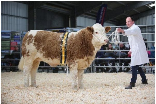
Bosahan Rosella Ingrid Venus Supreme Champion Cornwall Pedigree Beef Calf Show 2024

We wish purchasers of Bosahan cattle many pleasurable and successful years owning Simmentals.