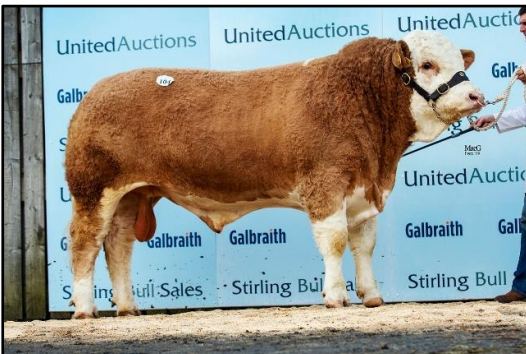
Knockreagh Immanuel 17

Knockreagh Immanuel was purchased at the 2019 Stirling Bull Sales where he was fifth in a strong class. His pedigree is packed with renown Northern Ireland bloodlines including Kilbride Farm Warren (Kilbride Farm Newry) and Omorga Donna (Sterling Herkules)