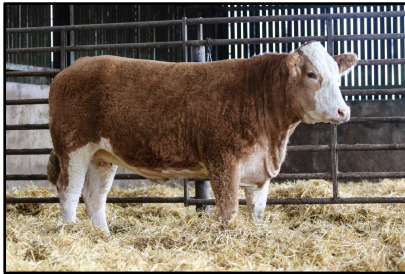
Lot 53 BOSAHAN RUBY RED CLOVER