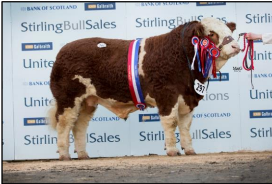
Derrycallaghan Ernest 13

Currently marketed by Norbreck genetics as a quality calf producer. Calving ease assured. Premium calves at market and a favourite amongst dairy farmers and pedigree breeders. Currently used as a stock bull on pedigree and commercial females at Islavale.