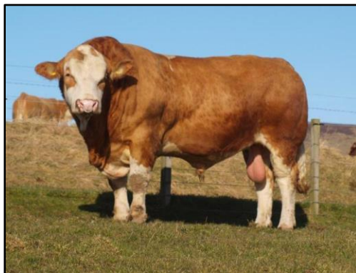
Dirnanean Apostle 09 (PP)

Apostle cows have been the strong hold of the Incheoch herd for some time, and we keep dipping back into the tank to breed some more. By a New Zealand sire and with a maternal grandmother straight out of the AWL herd in Manitoba, he's reliable on functionality— a fixer on feet and udders.