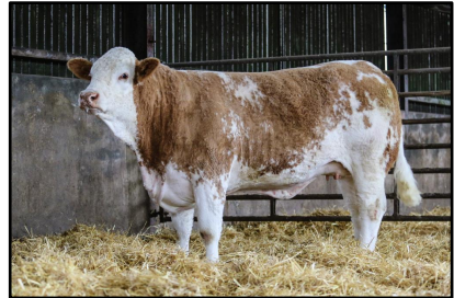
Lot 52 BOSAHAN ROSELLA INGRID VENUS