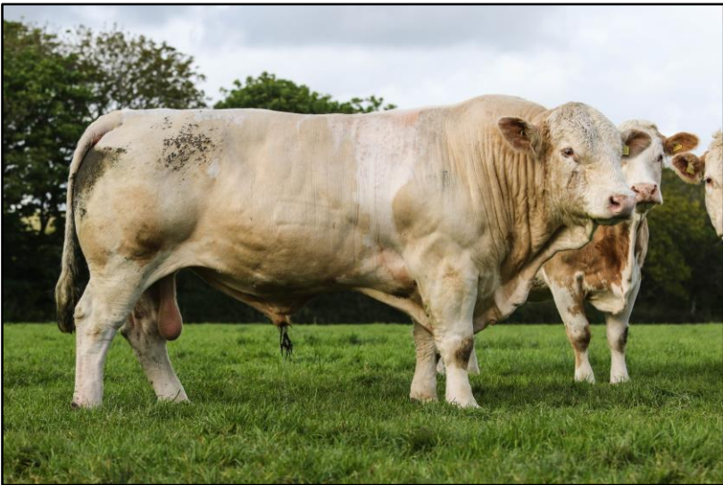
Heathbrow Freddie Star 14 P