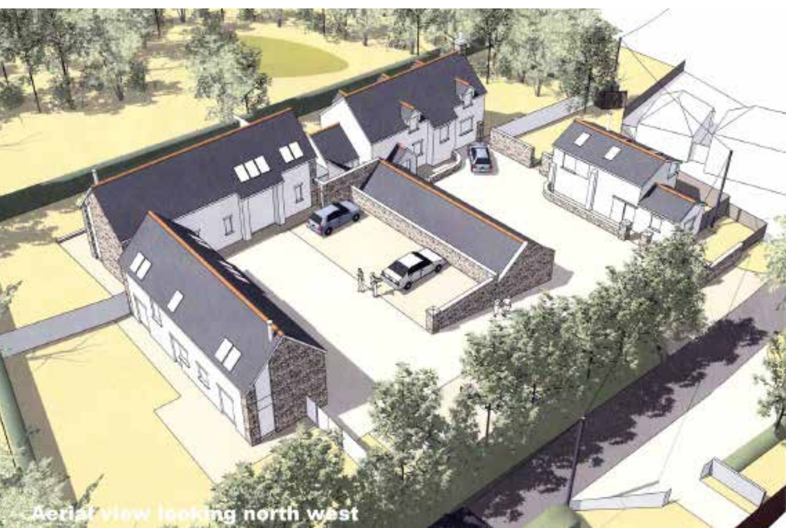
Aerial view looking north west