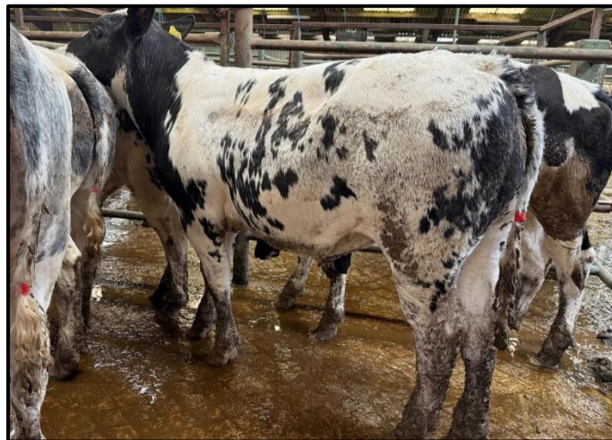
6-month-old Blue stirks to £1300