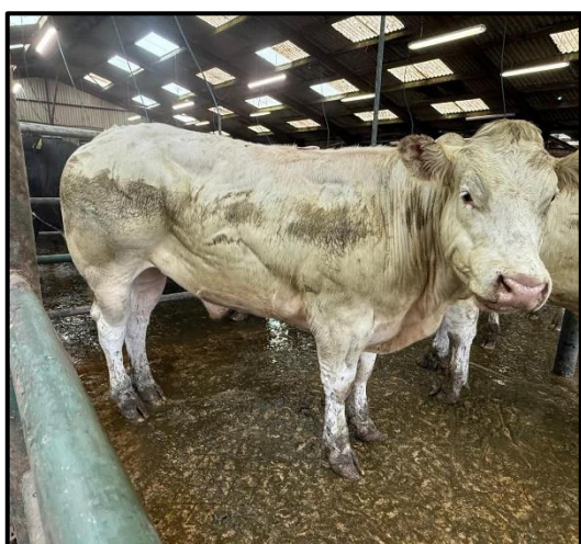
Charolais Steer at 18-months-old to £2280

Cows – A beautiful pedigree Limousin Cow made £2200 (57m) for WT Key and Sons of Wadebridge.