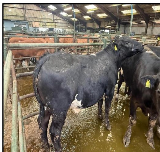
Limousin Steer at 11-months-old to £1630