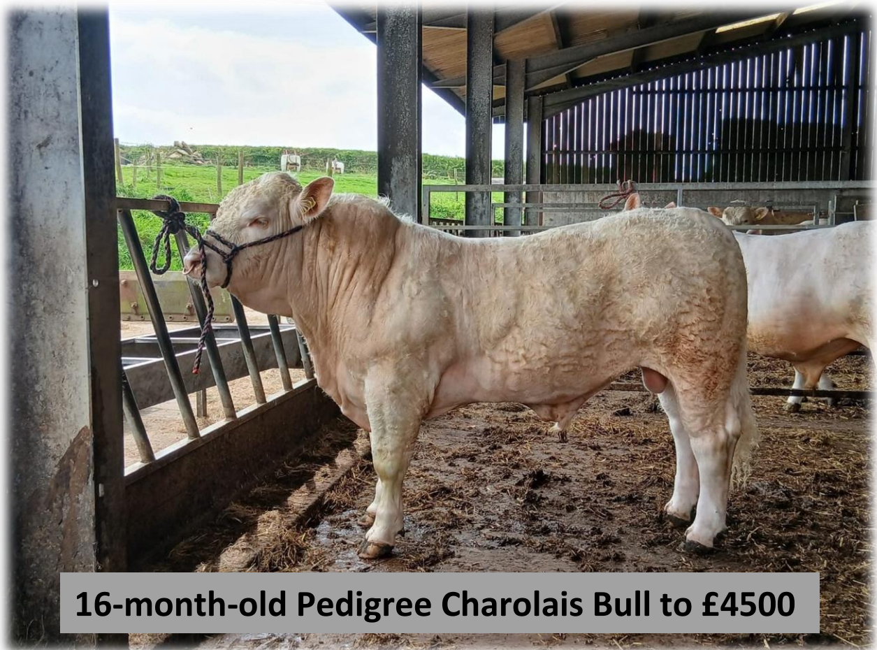
16-month-old Pedigree Charolais Bull to £4500