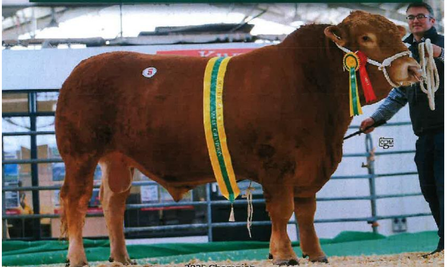
2025 Champion, Trewint Capri exhibited by PS & AP Rowe