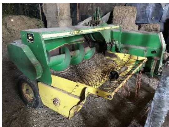
John Deere 456A conventional baler