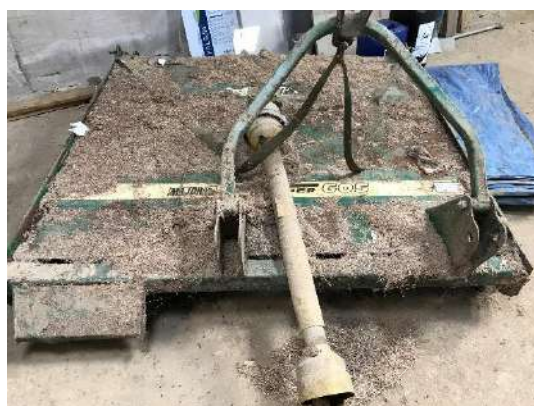
Major 605 topper